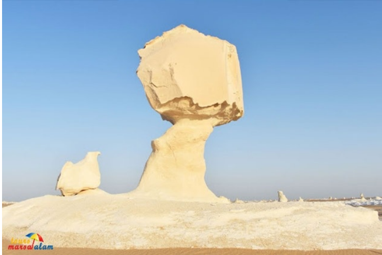
The chicken-shaped rock

There are hundreds of images here each one is reminiscent of an animal- A chicken- A sphinx, Camels, tents, Mushrooms