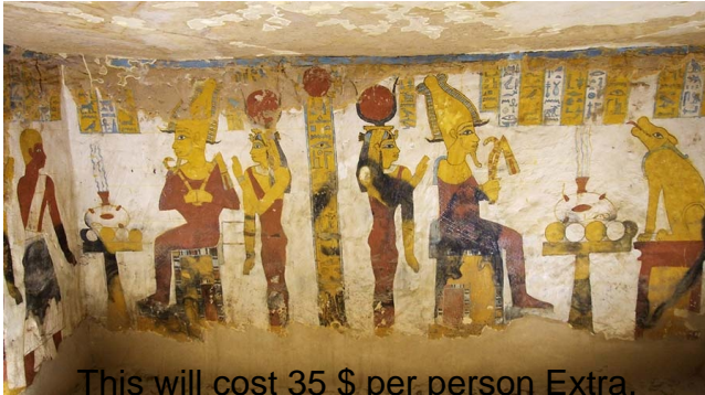
This will cost 35 $ per person Extra

Visit Bawiti , Bawiti is the Capital of Bahariya Oasis , Then Visit the Museum of the golden mummies and the temple of Ain El Muftella, Bahariya Oasis , You will have lunch in Bahariya Oasis before driving to Cairo