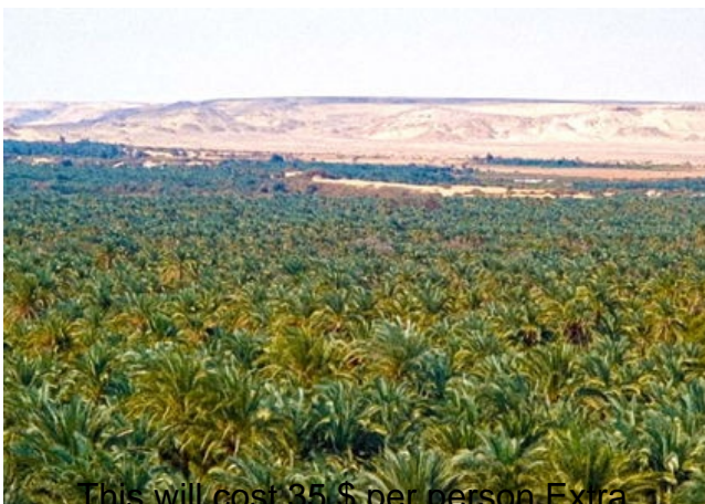
This will cost 35 $ per person Extra

You will discover Bahariya Oasis , The palm, and olives fields, Gebel Maghrafa. where the biggest Diansour( (Stromer's Tidal Giant) was ever discovered in 1914 at the base of Gebel Dist. Lake al-Marun which is the biggest salt lake in Bahariya Oasis , Enjoy the sunset from The summit of the English Mountain(Gebel Al Ingleez). the view from the top offers a panorama of the northern part of the oasis. drive to Cairo