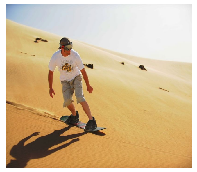
then arrive at the white desert at 16:00

Then you will adventure the desert by discovering Qaraween sanddunes by Jeep 4x4 and Enjoy sandboarding -