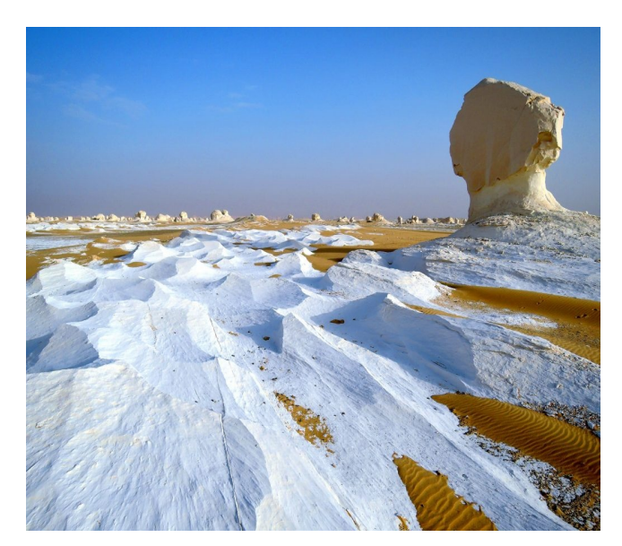
17:30 Make tents and Enjoy the sunset

18:30 As the sky turns pink then the deepest fiery orange, the rockshapes fade, and silence are all around. Sitting around a small fire and enjoying the simplest meal of chicken, rice, and vegetables, you will feel like nothing has ever tasted so good. Bedouin staff will arrange dinner and desert camping. (Vegetarian food is available )