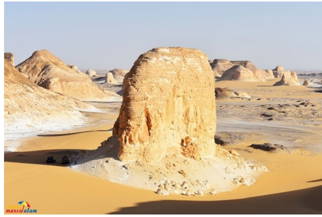
16: 30 explore the <u>white desert</u> National Park, the most well-known desert destination in Egypt.