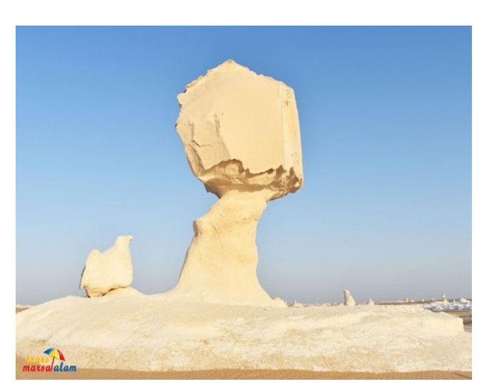
The chicken-shaped rock

There are hundreds of images here each one is reminiscent of an animal- Chicken- A sphinx, Camels, tents, Mushrooms