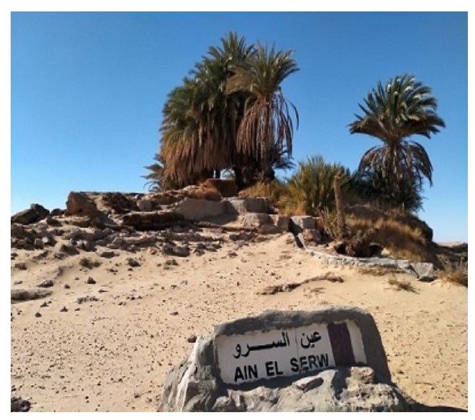
Lunch will be served at Ain El Serw

Then you will adventure the desert by discovering Qaraween sanddunes by Jeep 4x4 and Enjoy sandboarding -