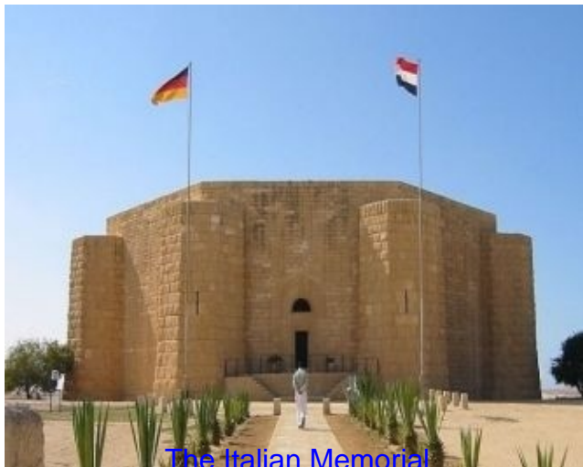
The Italian Memorial

Thee kilometres,west of the Italian marker, the German war memorial is a single octagonal building erected in 1959, overlooks the sea, Patterned after the castle del Monte. the memorial contains the bodies of 4280 German soldiers, at the Entrance, it stands an impressive golden mosaic, to the right of the Entrance is a small chapel where families and friends honour the dead with wreaths, Photographs and memorial ribbons.