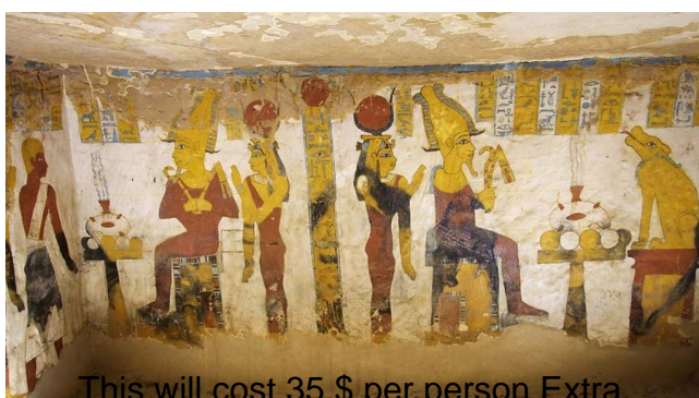
This will cost 35 $ per person Extra

Visit Bawiti , Bawiti is the Capital of Bahariya Oasis , Then Visit the Museum of the golden mummies and the temple of Ain El Muftella, Bahariya Oasis , You will have lunch in Bahariya Oasis before driving to Cairo