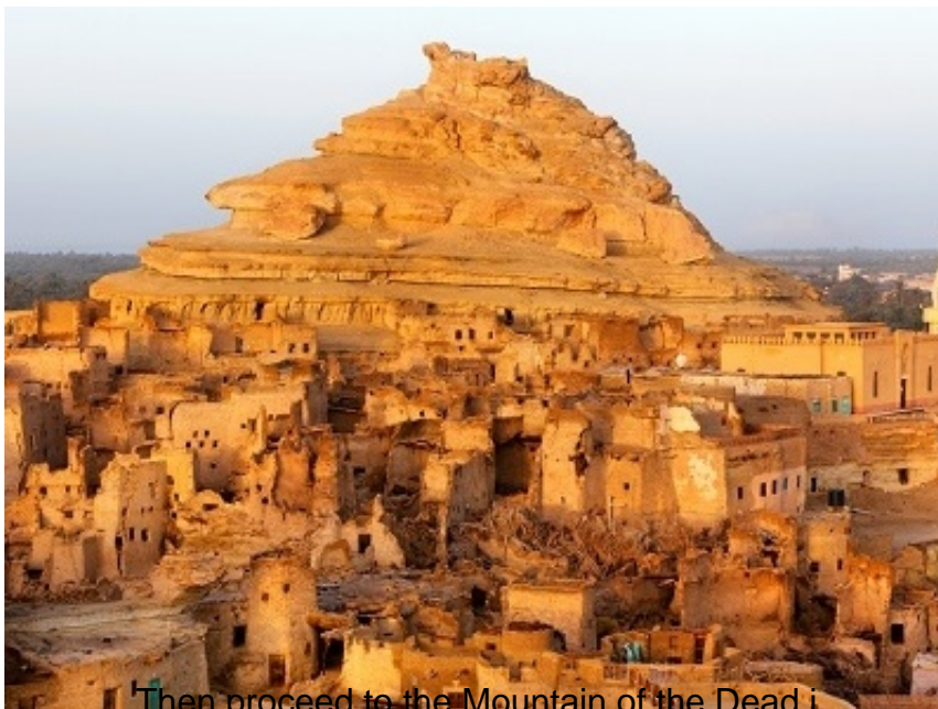
Then proceed to the Mountain of the Dead i

The Shali Fortress was built on a hill inside a Protective wall originally breached by a single gate, the maze of mud-brick buildings that Comprises the Fortress served the people of the oasis for nearly 8 centuries. The inhabitants had to live in the narrow quarters, sharing their animals, which were herded into the fortress each evening. The huge chunks of salt so prevalent in Siwa oasis were used in the construction of the fortress, as they helped to strengthen the wall, Rain has unfortunately proved to be more destructive to the fortress than any human invaders. the fortress was built in the 13th century and served as the center of Siwan life for over 800 years. The fortress' mosque is still in use today, with many of the homes restored, and some even turned into local guesthouses.