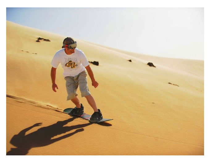
Gebel Al Mudawara

Then you will adventure the desert by discovering The Magic lake by Jeep 4x4 and Enjoy sandboarding -