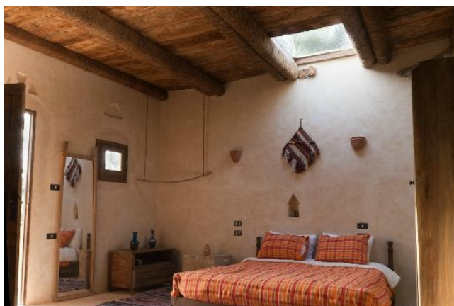
Have an amazing night in siwa

Ghaliyet is a unique SPA Ecolodge just located nearby Amoun Temple and Alexander the greatest oracle in Siwa Oasis. It has been built by nature and designed among palm trees. you can feel the history and the great ancient stories of Alexander the great while you are in Ghaliyet. Enjoy nature, organic design, organic food, and different health programs. The ecolodge includes 12 cozy rooms; each room has its special personality and feeling. You can enjoy staying in the upper rooms with the transparent glass ceiling opening and you feel like you are sleeping in heaven. Also, you can experience the unique outdoor privacy in the lower rooms with their private backyard.