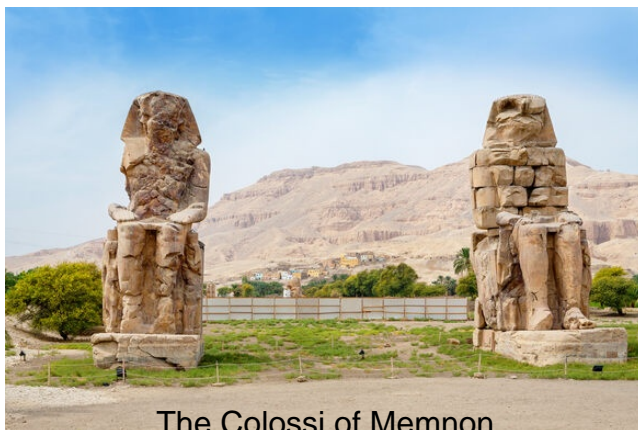
The Colossi of Memnon

Most of the decoration inside the tombs is still well preserved. If you wish to visit the Tomb of The young Pharaoh Tutankhamun . It costs 300 Egyptians Pounds Extra