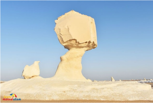
The chicken-shaped rock