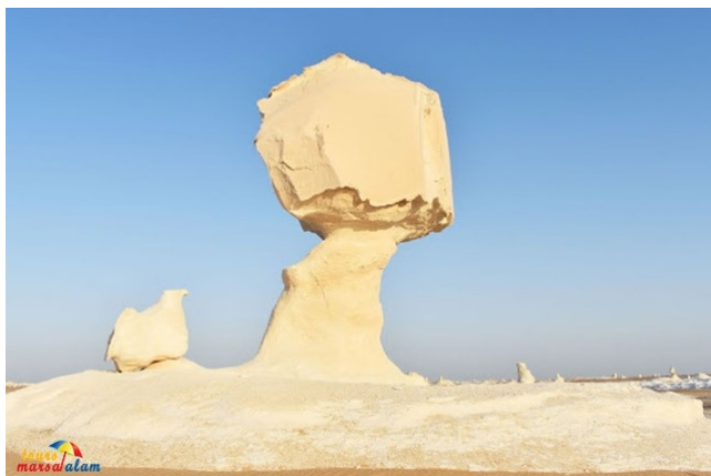
The chicken-shaped rock