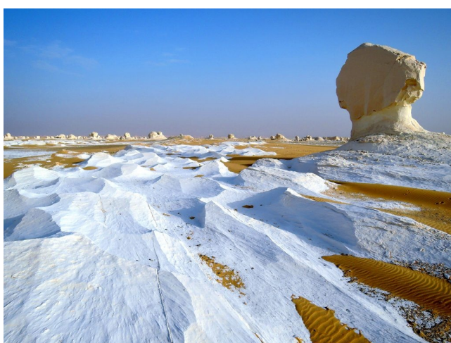
17:30 Make tents and Enjoy the sunset

18:30 As the sky turns pink then the deepest fiery orange, the rock-shapes fade, and silence is all around. Sitting around a small fire and enjoying the simplest meal of chicken, rice, and vegetables, you will feel like nothing has ever tasted so good. Bedouin staff will arrange dinner and desert camping. ( Vegetarian food is available )